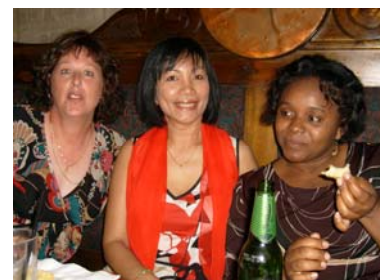
Having a chat and a bite to eat