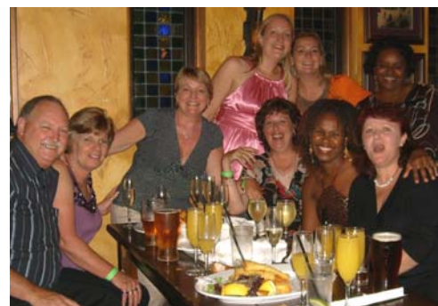
Enjoying some drinks and nibbles after some dance floor action!